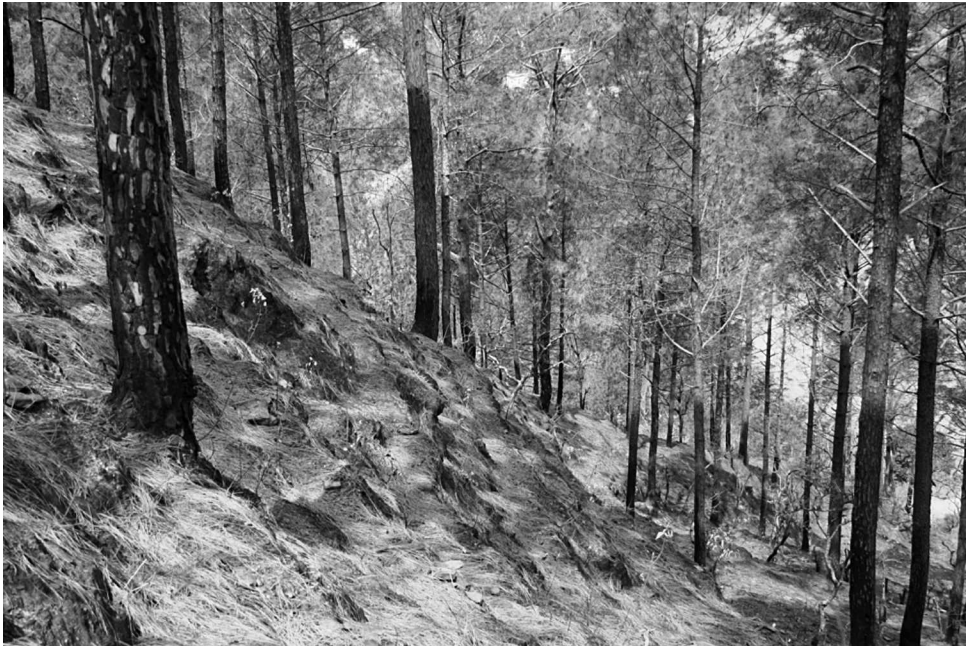
Figure 2. Representative view of the SAN site. Note lack of understory vegetation at the time of sampling in May, 2009.

burned, probably within a month of our sampling. There was only a thin dusting of needle cast as ground cover over much of the stand when we were there, although sprouting grasses were present in some profusion and likely would have been much more prominent after the start of the monsoon rains.