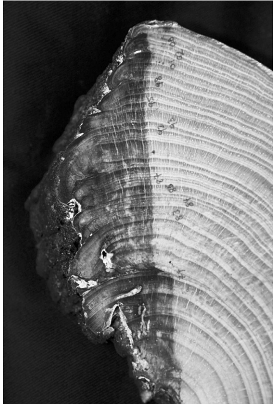
Figure 4. Image of cross-section sample cut from tree SAN 1.

we sampled had very clear fire scars, and the crossdating—although difficult because of the false rings—was possible. However, in the stand sampled we did not find very old trees, although older chir pine (> 300 years) have been collected from other areas of its range in the Himalaya. Previous studies from both the Uttarkashi region in the Garhwal Himalaya (Shah 2006) and from the Central Himalaya in Nepal (Bhattacharyya et al. 1992) found chir pine trees dating from the late